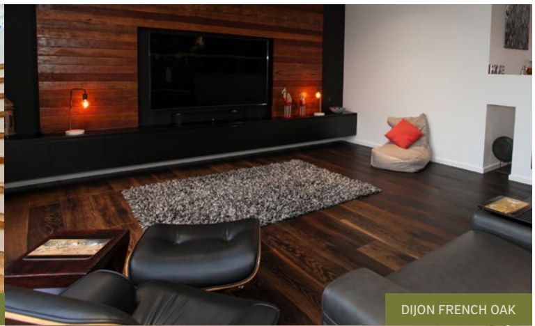
DIJON FRENCH OAK