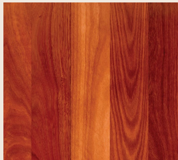
Species hardness is measured in Janka numbers - the higher the number, the harder the species.