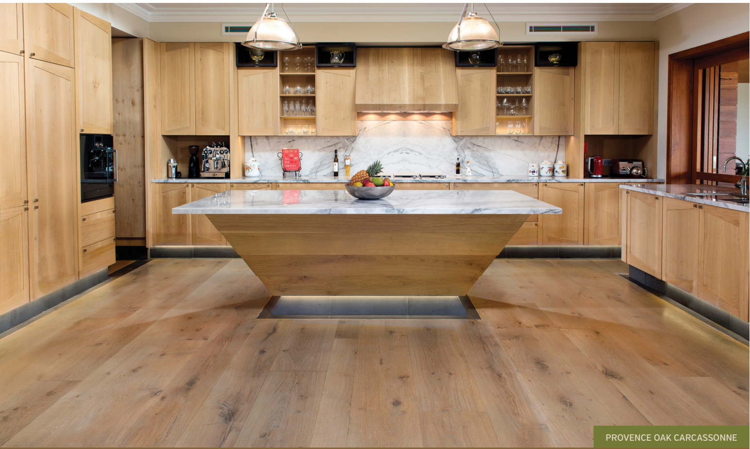
PROVENCE OAK CARCASSONNE