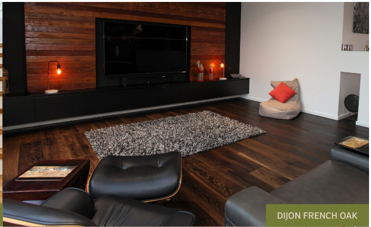
DIJON FRENCH OAK